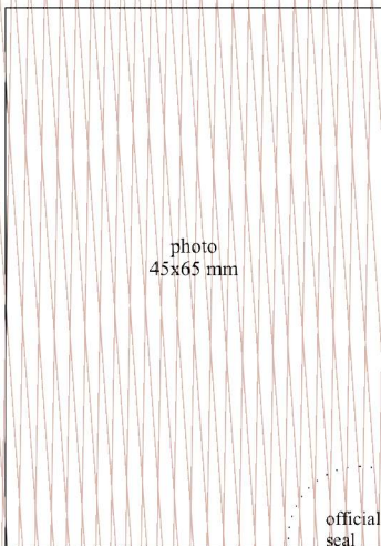
photo 45x65 mm

Full qualification at Polish Qualifications Framework level six